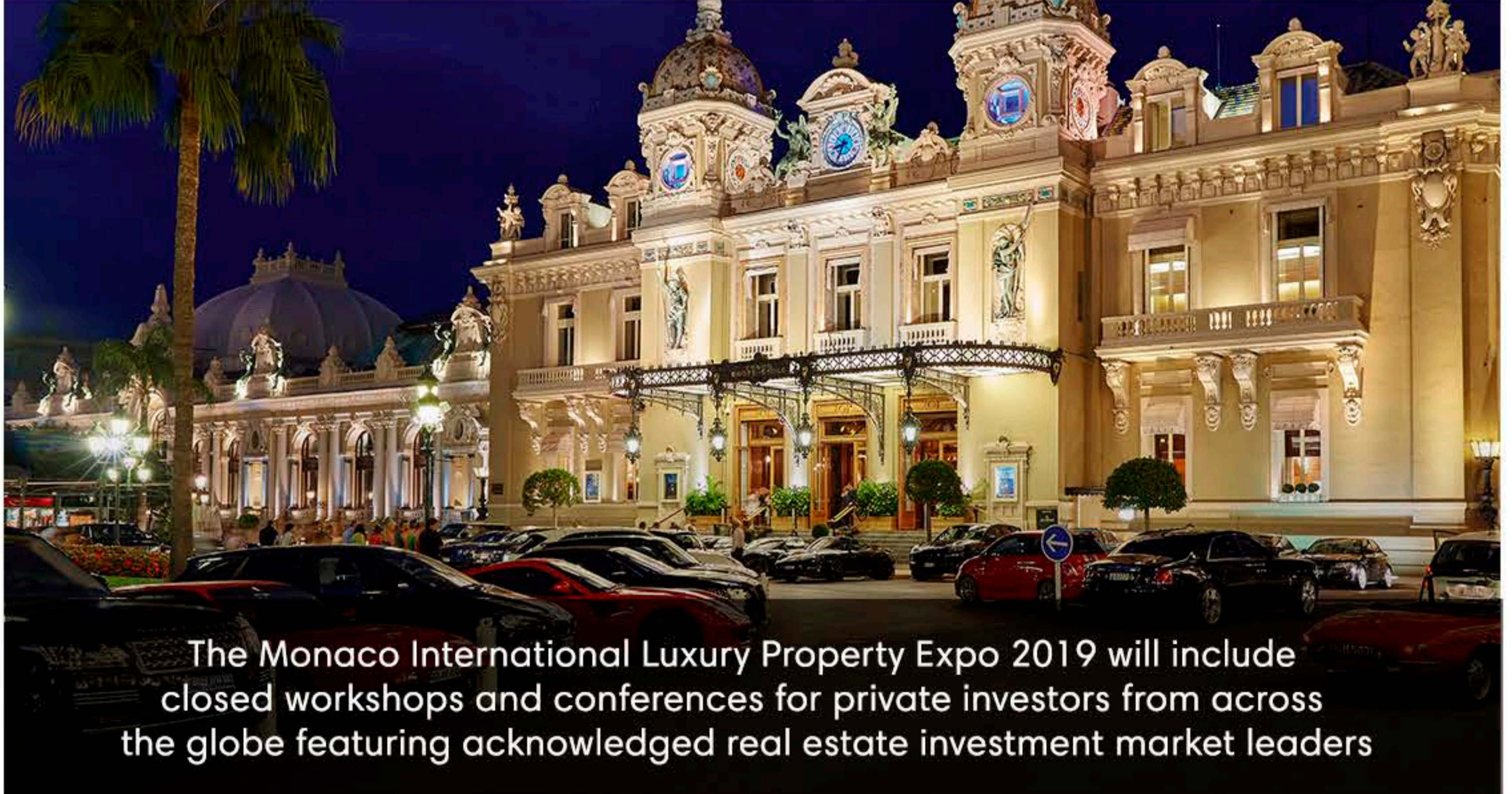
The Monaco International Luxury Property Expo 2019 will include closed workshops and conferences for private investors from across the globe featuring acknowledged real estate investment market leaders

LEARN EVERYTHING YOU'VE WANTED TO KNOW ABOUT THE LUXURY REAL ESTATE MARKET